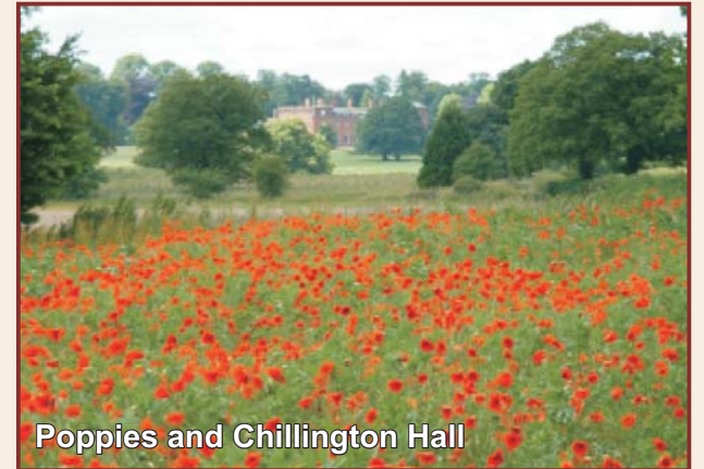
Poppies and Chillington Hall